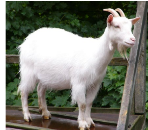
The Learning Professor