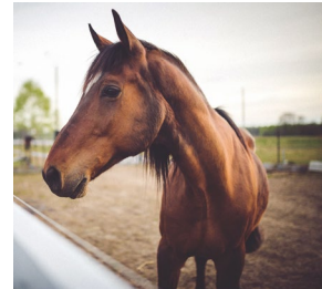
The Learning Professor